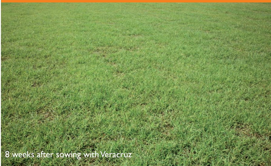
8 weeks after sowing with Veracruz

“We will be using more seeded couch for next season’s conversion. It’s very fast establishing. 6-8 weeks after planting we had 90% cover. Following the Winter, Veracruz was quite worn, but we found it bounced back to full cover.”