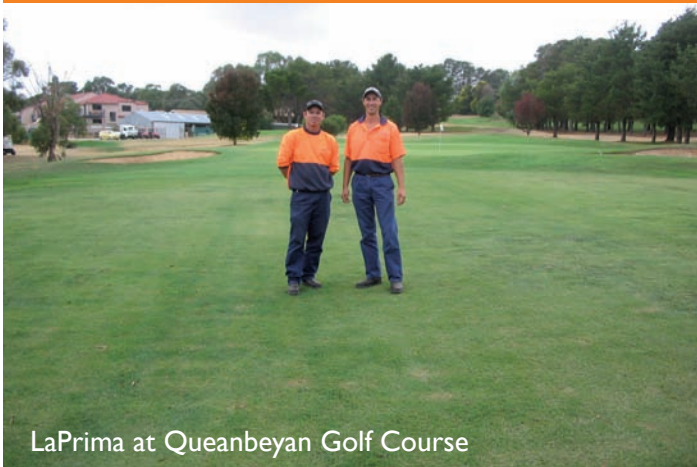
LaPrima at Queanbeyan Golf Course

“LaPrima exhibited the key features we required.”