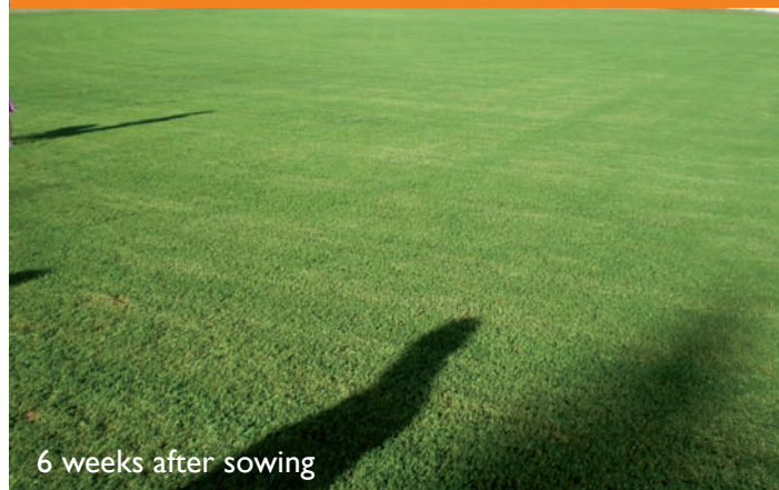
6 weeks after sowing

“LaPrima couch sown at Coolamon Rovers sportsfield. Results just 6 weeks after sowing.”