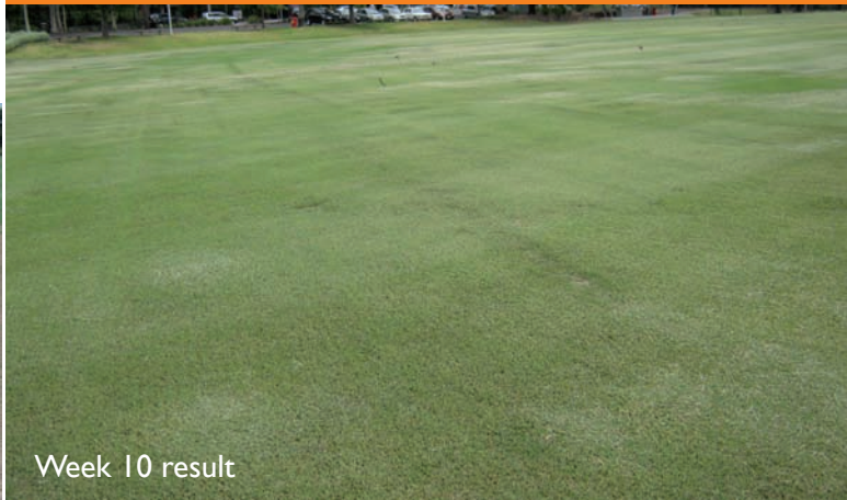
Week 10 result

“LaPrima XD held up well under traffic and recovered well after its first winter.”